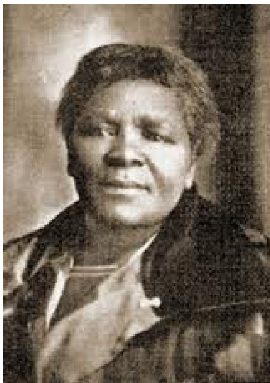
Nadezhda Krupskaya, b. 1869; Vladimir Lenin, b. 1870; Rosa Luxemburg, b. 1871; Alexandra Kollontai, b. 1872; Charlotte Maxeke, b. 1874 . One generation.

If we do not draw women into public activity, into the militia, into political life; if we do not tear women away from the deadening atmosphere of household and kitchen; then it is impossible to secure real freedom, it is impossible even to build democracy, let alone socialism.